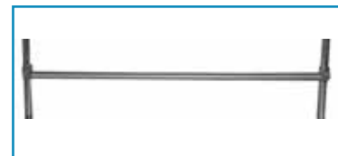
Incorporate rear roll holder