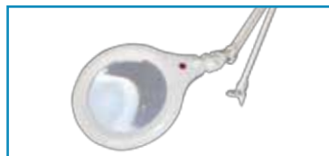
Incorporate magnifying lamp